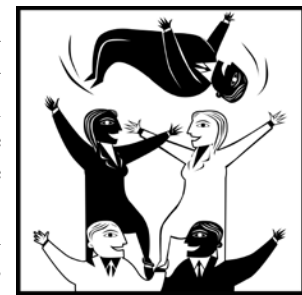
Figure: Building a Learning Organization

For organizations wishing to remain relevant and thrive, learning better and faster is critically important. Many organizations apply quick and easy fixes often driven by technology. Most are futile attempts to create organizational change. However, organizational learning is neither possible nor sustainable without understanding what drives it. The figure below shows the subsystems of a learning organization: organization, people, knowledge, and technology. Each subsystem supports the others in magnifying the learning as it permeates across the system.